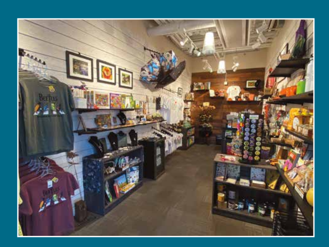
Bugzoola is open Tuesdays through Saturdays from 10:00 AM to 5:15 PM and Sundays from 12:00 PM to 4:15 PM. Closed on Mondays.