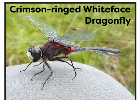
Crimson-ringed Whiteface Dragonfly