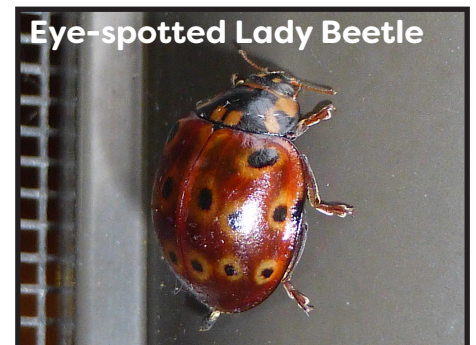
Eye-spotted Lady Beetle