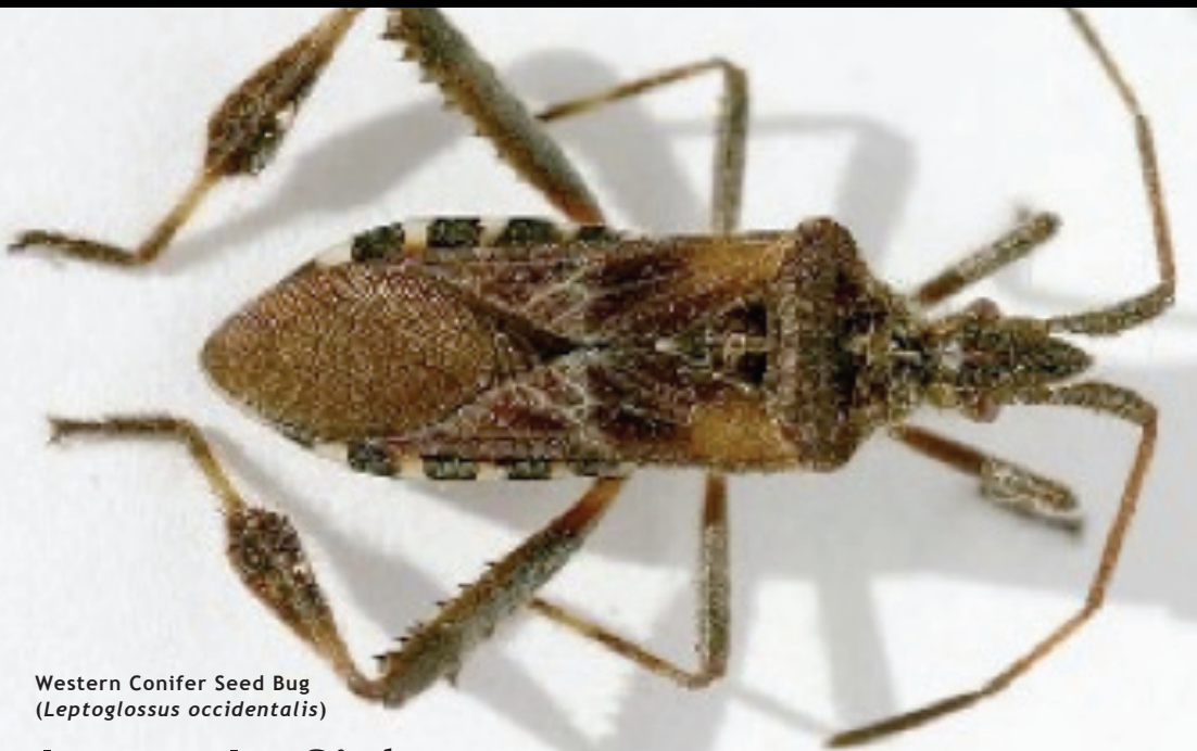
Western Conifer Seed Bug ( Leptoglossus occidentalis )