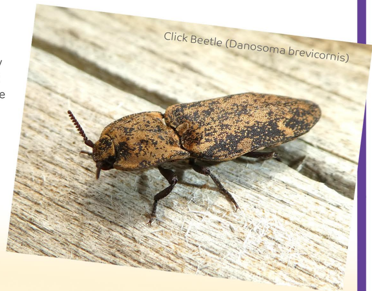
Click Beetle ( Danosoma brevicornis )

Our thanks to everyone who submitted photos this year and to all of our enthusiastic What's Buzzin' followers. 🐛