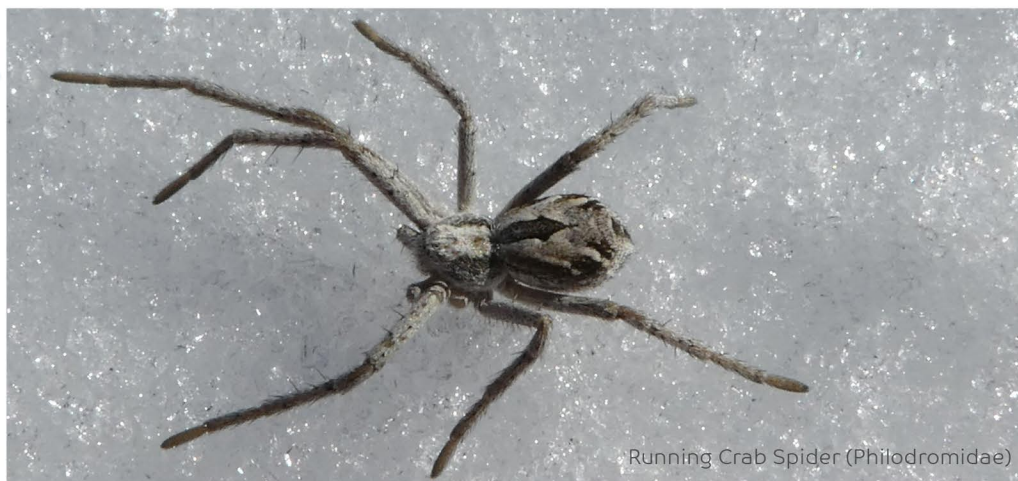
Running Crab Spider (Philodromidae)

We've got you covered. Check out our website for our Online Bug Encounters and other entertaining and educational resources including Notes from the Lab , our Bug Bytes podcast, and more at missoulabutterflyhouse.org .