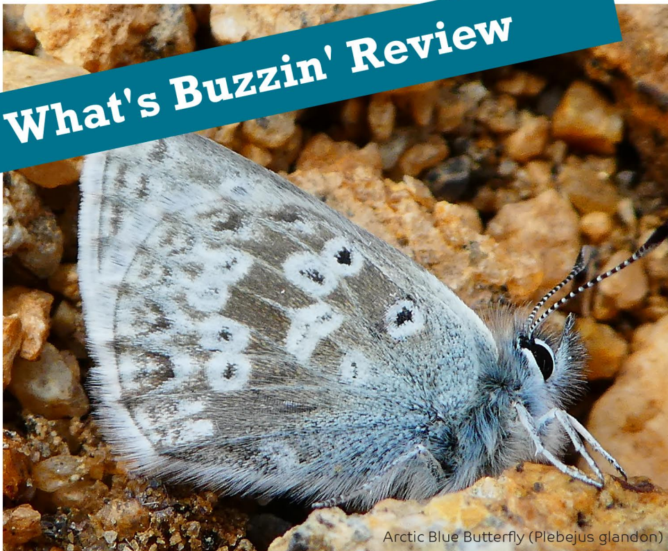
Arctic Blue Butterfly ( Plebejus glandon )

Some ideas and projects begin in strange ways. For us, the idea for our What's Buzzin' report began with the receipt of a package containing a deceased giant water bug with a letter asking, "What is this?" Your average person (or more accurately, almost all people) would be taken aback by opening a package to find a dead bug inside. We, on the other hand, excitedly replied to the sender regarding what they had found. While receiving dead bugs in the mail is not common (even for us), a similar scene began playing out on a weekly basis over email and social media as more and more people submitted photos of various creepy crawlies they had found. The idea for What's Buzzin' was born.