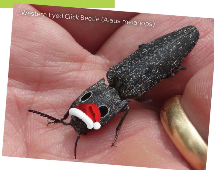
Western Eyed Click Beetle ( Alaus melanops )

If you have questions about our programs, making a donation of stock, or considering a gift to our capital campaign, please contact Glenn at 406-317-1211 or glenn@missoulabutterflyhouse.org .