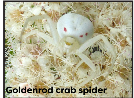
Goldenrod crab spider