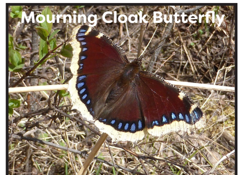
Mourning Cloak Butterfly