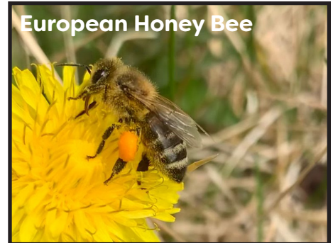
European Honey Bee

I am yellow or white and have eight legs and eight eyes. Many think I look like a miniature crab. My two front pairs of legs are extra-long and I hold them out to either side. You might find me hunting on flowers that match my body color. I sit and wait for a bee, fly, or other pollinator to catch and eat.